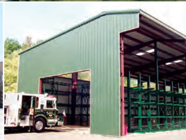
PRE-ENGINEERED STEEL BUILDINGS