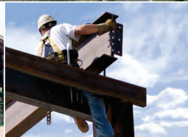
GENERAL CONTRACTING AND CONSTRUCTION