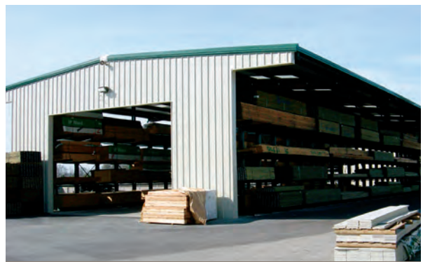
DRIVE THRU BUILDINGS