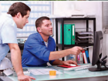
PLANNING AND DESIGN