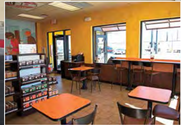
Dunkin' Donuts, Amarillo, Texas, new location