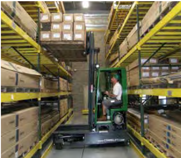
Pallet rack with narrow aisle, side-loading fork lift