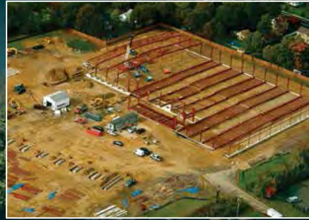
Kuiken Brothers, Succasunna, NJ distribution facility