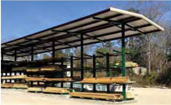
T-shed cantilever rack system with roof