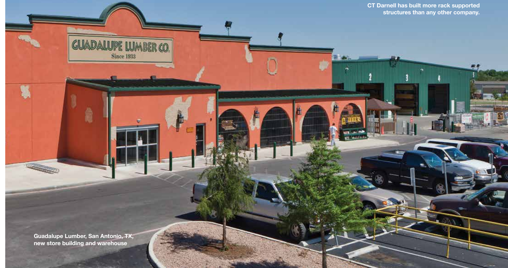
Guadalupe Lumber, San Antonio, TX, new store building and warehouse