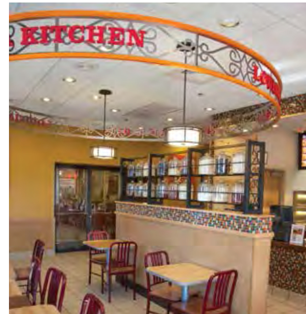
Popeyes Chicken, Weatherford, Texas, new location