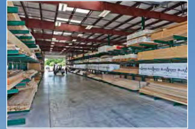
CT Darnell has built more rack supported structures than any other company.