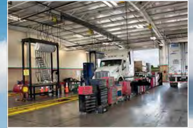
Petro and Truck Stops of America, service plazas and garages, multiple locations