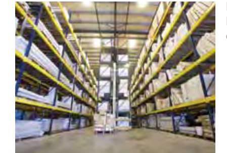
Kelly's, Nassau, Bahamas, distribution facility