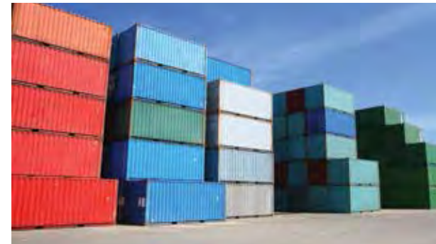
Arawak Development Corporation, Nassau, Bahamas, inland container handling facility