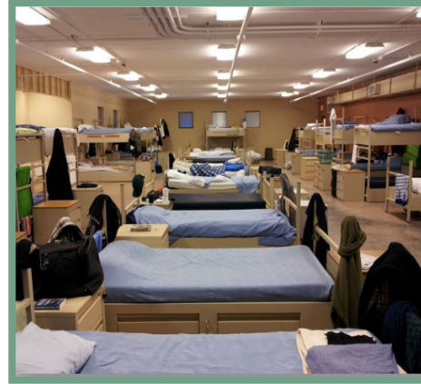
The most beds in the Midlands

“In the past six years, thanks in part to Transitions, the readers of the Post and Courier Free Times have voted Columbia’s Main Street District the ‘Biggest Improvement in Columbia This Year’ four times.”