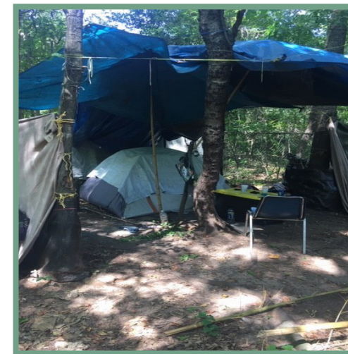
Just outside Redbank