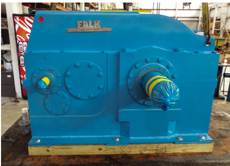
Rebuilt Falk 2140Y3