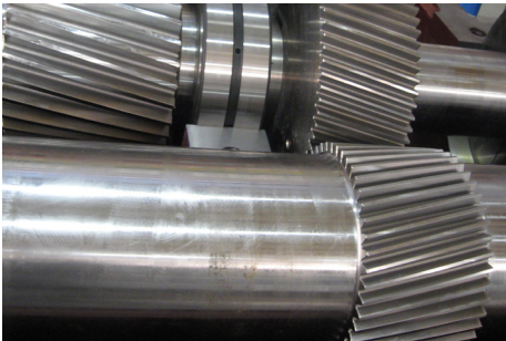
2-speed conveyor gearbox during repair