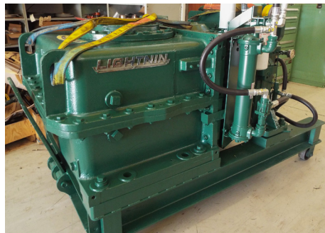
Rebuilt Lightnin mixer gearbox