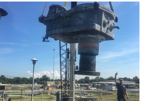
Field services at wastewater treatment plant