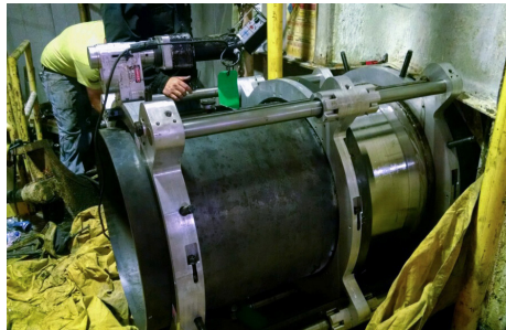
Washer drum journal field machining