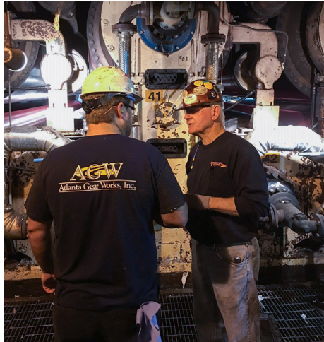
Dryer gear replacment on site at paper mill