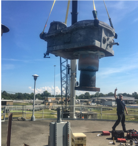
Field services at water treatment plant

When your line is down, we come to you. Our Field Machining and Services division is available 24 hours a day, 7 days a week, with experienced field machinists, millwrights and technical service representatives ready to handle any of your gearbox problems. Our field technicians can provide you with everything you need, from total turn-key troubleshooting and repair to specific problem-solving, all expedited by on-site machining - including line boring, journal repair and hydraulic drilling and boring.