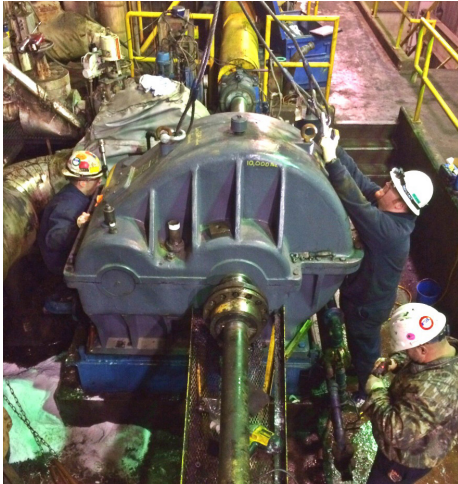
Turbine gearbox replacement on site at paper mill