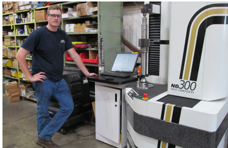
AGW engineer operating Pentagear gear checker