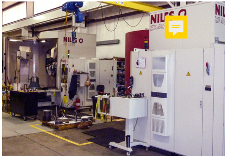
Kapp Niles CNC gear grinders