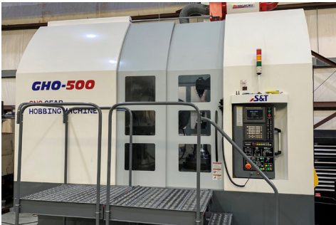
CNC gear hobber